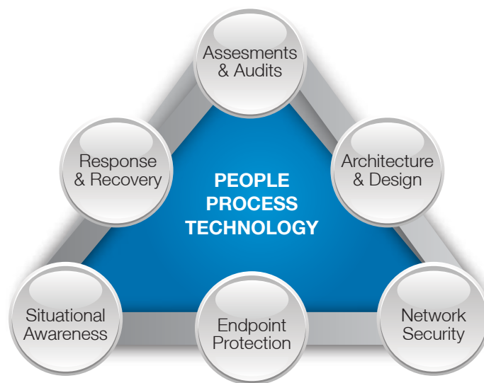
Fig 1: Approach to holistic cyber security

To better understand the lifecycle approach, consider some key project phases. Early on, auditing and assessment identifies assets and uncovers vulnerabilities in the control system as well as allied systems and technologies (safety systems, asset management applications, closed circuit TV monitors, etc.).